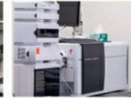
Drug Testing by LCMS