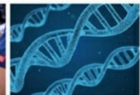
Pharmacogenomic (PGx) Testing