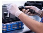
Urine Wellness Testing